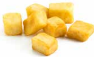
FreshCut Dark Red Norland Small Chunky Diced Skin on 56210 04561