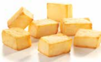
Small Chunky Diced Potatoes Skin on 56210 04125