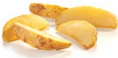
FlavourCrisp Prime Cut Rosemary and Garlic Wedge 56210 37227